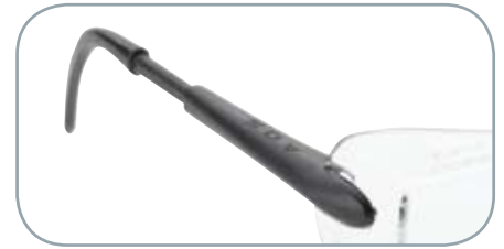
High Impact Nylon Temples