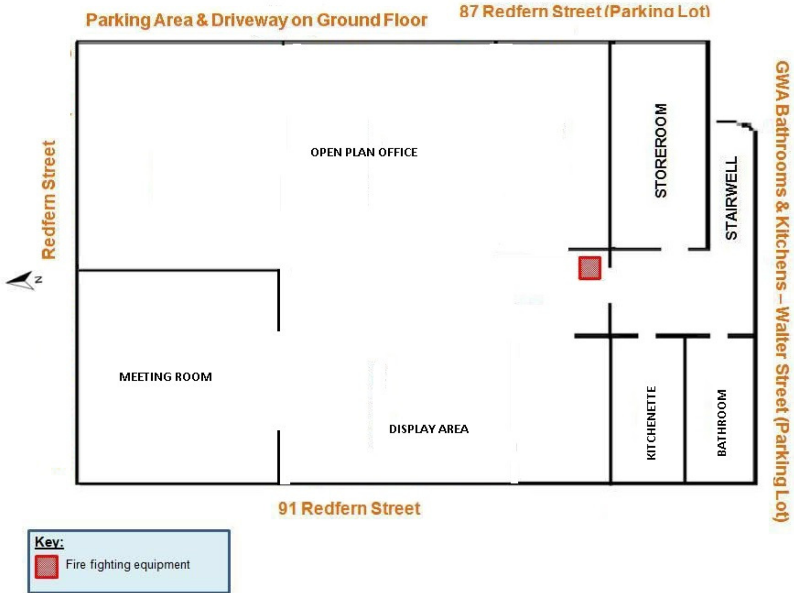
Figure 2 First floor map of TMS premises

Tank Management Services – 89, Redfern Street, Wetherill Park, NSW